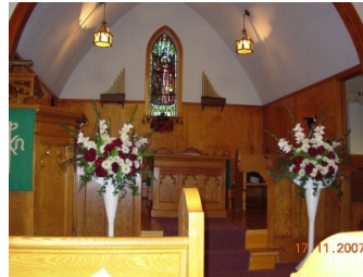
View of the front of the church with two of the floral arrangements.

Carol Shetler c-caroli@hotmail.com 905-723-0671