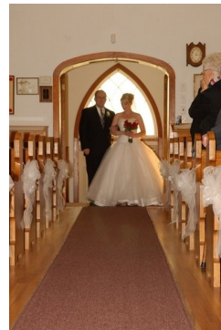
View looking from the front to the back of the church centre aisle.